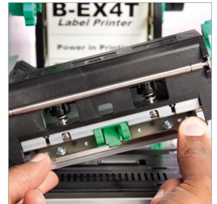
Snap-in printhead reduces maintenance downtime to a minimum