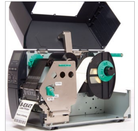
Easy access for maintenance and consumables loading