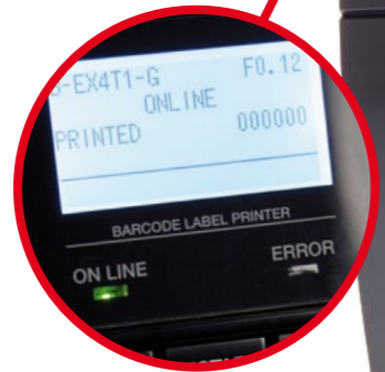
User-friendly front panel for easy operation and status reporting with helpdesk